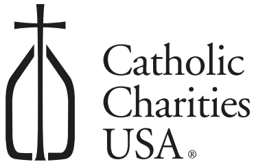
Safe Harbor Interim Housing

We are so blessed to partner with the following agencies, without whom essential programs would not be possible.